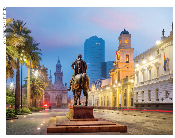
Plaza de las Armas, Santiago de Chile

In the last five years, leading telecoms operator Mundo has established itself as an outstanding digital services provider with the second largest fiber optic network in the country. The firm has more than 700,000 customers and 10,000 kilometers of fiber optic trunk network. As experts in the deployment of fiber optics, Mundo is proud to have been a key player in the long-awaited