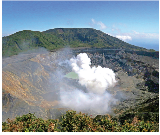
Poás is one of over 60 active volcanoes in Costa Rica