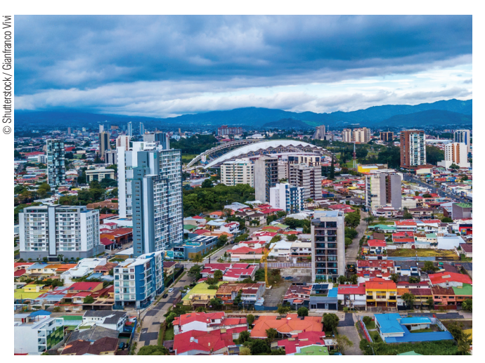
Costa Rica's vibrant capital, San José

Another organization that illustrates the triple-value concept is