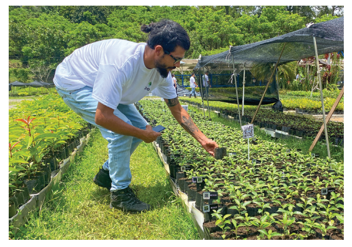
EC030's protocol creates carbon offsets by planting healthy new trees

"For all this, for the future we foresee the generation of more messages focused on sustainabil-