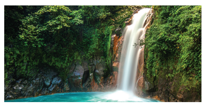
Known for its natural beauty, Costa Rica's growing ecomony is also very attractive

Now is the ideal time to invest in one of Costa Rica's many thriving sectors as the pro-business government rolls out a red carpet for investors and removes red tape