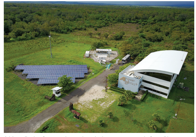
Ad Astra Rocket Company is creating a hydrogen ecosystem in Costa Rica