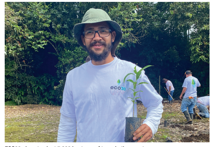
EC030 plans to plant 5,000 hectares of trees in the country every year

As well as supporting the planet's decarbonization and demonstrating how nature and technology can be symbiotic, ECO30's activities will have significant