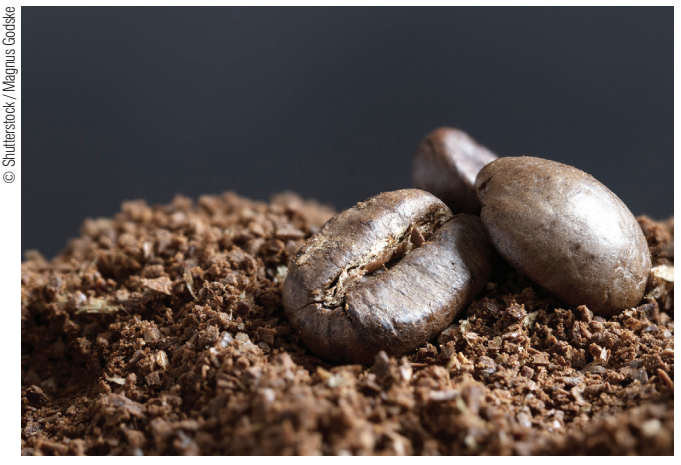
At least 79% of Costa Rican coffee export revenues go directly to the producers

To encourage more and larger productions to the country, the government has implemented a new legal framework based around five types of incentives. "These are a 60-day cash reimbursement of 90% of taxes paid with no item restrictions; no taxes for international producers, directors, actors