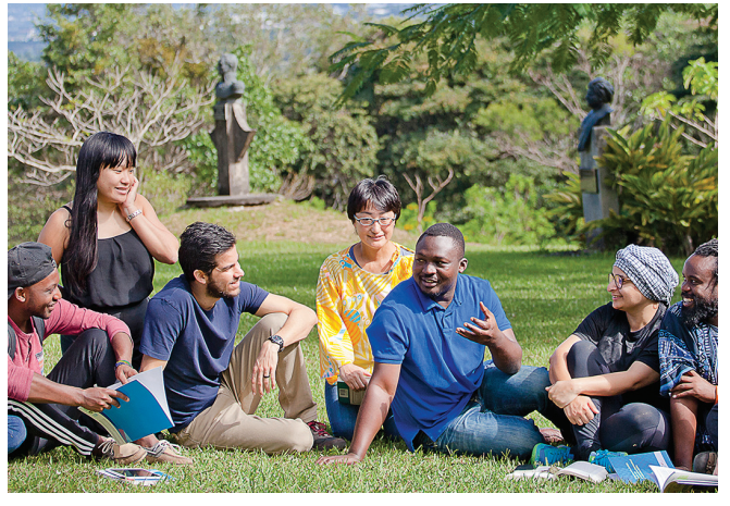
Around 192,000 students enrolled in INA's training programs in 2021

working in technology, life sciences, business and professional services, Investment Monitor reports. "The activities that have positioned the country where it is today are medical device manufacturing, other advanced manufacturing and a buoyant, rapidly expanding corporate services sec-