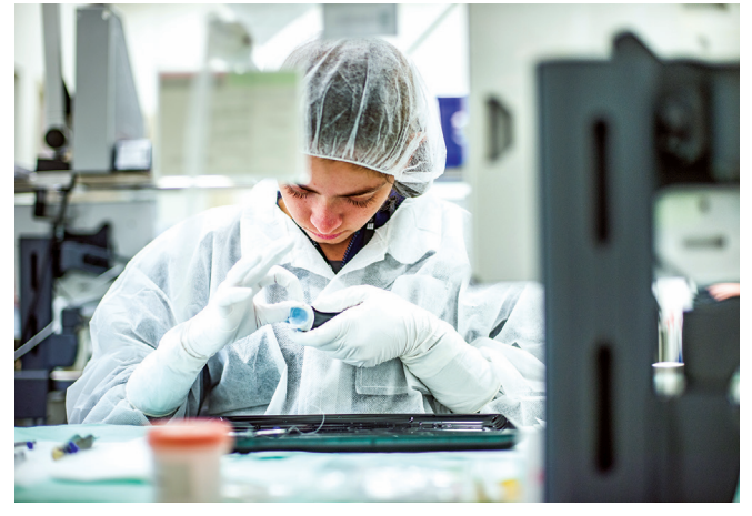
INAMU supports equality in science education, training and employment

Equally important to the CEO is that SJO won the prize for best airport staff in its region at the awards: "Just as we focus on the passenger experience, we believe in the employee experience. Our employees are the center of the organization and our job is