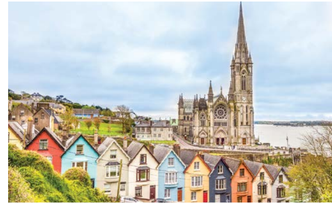
Ireland is revamping lifelong education to bolster regional economies

Ireland's financial sector's adoption of green policies is a sign of the times. The moves are part of Ireland's climate act signed into law in July 2021 that seeks to reduce carbon emissions by 51% in the next decade and make Ireland a leader in the EU on combating climate change.