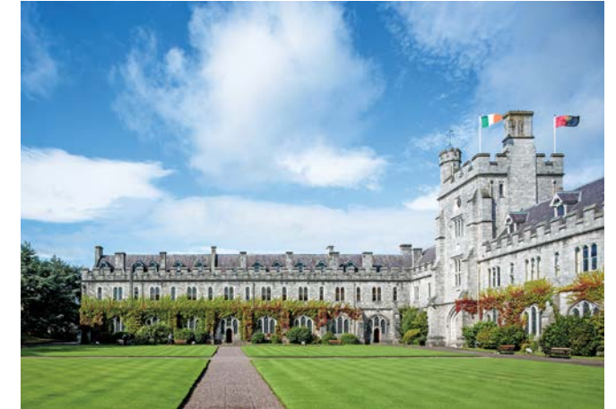
University College Cork's campus is a hotbed of research and ingenuity