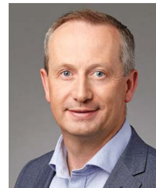
Leo Clancy CEO, Enterprise Ireland

LC: COVID-19 created unprecedented challenges for everyone. From the outset, our approach was focused on helping companies stabilise, reset and recover. This included creating a dedicated COVID-19 response hub that provided crucial advice to over 8,000 companies; a scheme targeted at sustaining 27,500 jobs across Irish enterprises; and grants to hundreds of retailers to quickly pivot their offerings online. The move to digital is a crucial first step for many companies to move into foreign export markets and build a stronger base. Additionally, we provided direct support for companies who required financial or