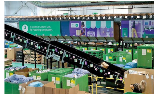
Digital technology is at the center of An Post's current transformation

We also elevated things that postal workers do naturally, such as calling in on the elderly and making sure they received the help they needed, whether it be groceries, medicine or messages. We set up a webpage where friends and family could register to have our postal delivery staff check in on their vulnerable loved ones. We also provided free postage for all letters and parcels going to and from nursing and care homes where the COVID-19 virus was extremely dangerous and visitors were barred. These initiatives really mattered to people and received tremendous