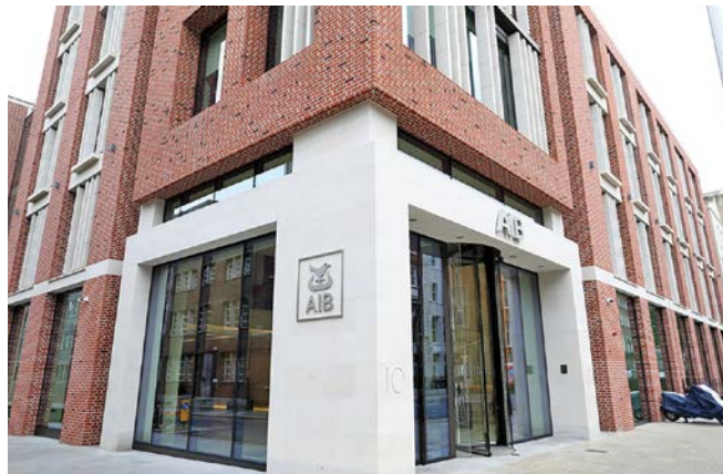
Allied Irish Banks intensified its product offerings during the pandemic

Customers who are active on our mobile technology are now connecting with us about 36 times a month on average. Cash usage is in parallel falling, while digital wallet transactions are up about 140% in terms of value in 2020 on a year-on-year basis. We have seen a huge wave of increased activity in fintechs across the banking industry globally. This