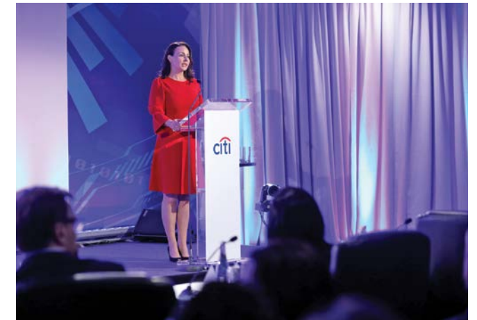
U.S. company Citi sees Dublin as its European and worldwide hub

Payments is one of the biggest areas for fintechs in Ireland, but there is also growth in digital currencies and regulatory technology, amongst others. We need to be really focused on the future and how we can ensure innovation and collaboration, and that new ideas must continue to be generated. Rapid advancement of our digital capabilities is essential to our clients. In the last few years there has been a convergence of consumer and corporate expectations,