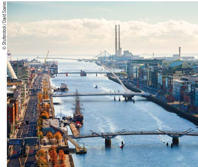
Dublin is home to a wide range of multinational offices and start-ups

When Britain declared it would relinquish its ties to the EU,