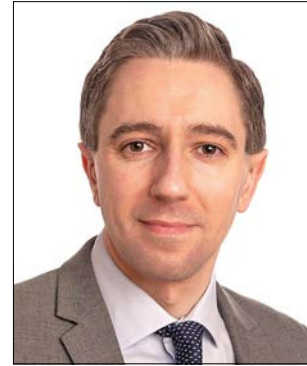
Simon Harris Minister for Further Education and Higher Education

Simon Harris, Minister for Further and Higher Education,