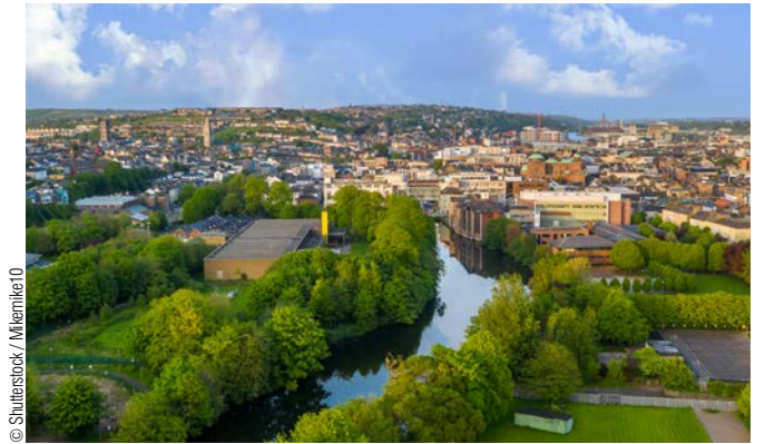
Universities in Cork are instrumental in fostering local start-ups