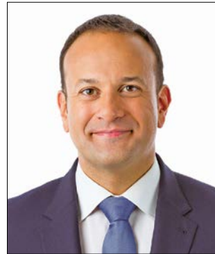
Leo Varadkar Leo Varadkar, Tánaiste and Minister for Enterprise, Trade and Employment

nations scrambled to reorganize relations with their northern neighbor. "Brexit isn't good for Ireland. The U.K. is our biggest neighbor and one of our most important trading partners," explains Varadkar.