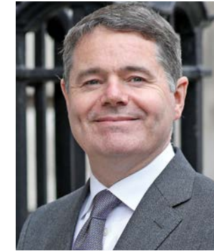
Paschal Donohoe Minister for Finance

NTMA's O'Kelly also thinks that the country's complete digital immersion is inevitable. "Investments in digitization will be enormous. It will be one of