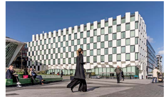
Enterprise Ireland has been pivotal in driving the growth of Irish companies