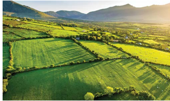
Ireland's agri-food sector accounts for 7.1% of employment in the country

mote sustainability in its food and beverage value chain?