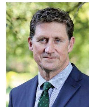
Eamon Ryan Minister for Environment, Climate, Communications and Transport

Due to Brexit, Ireland finds itself disconnected from its counterparts due to electricity