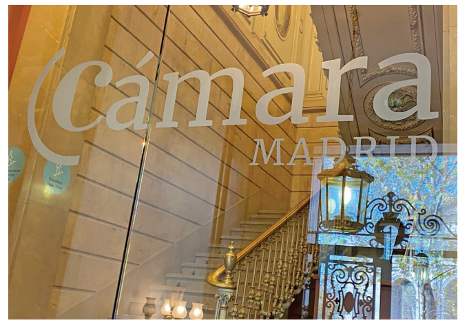
The chamber is headquartered at the 290-year-old Palacio de Santoña

AAL: We have managed to go from a loss-making chamber to one with a significant profit in the last year. This is