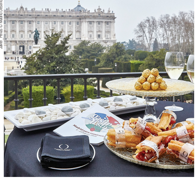
View to Palacio Real in the capital during the Madrid Gastrofestival

Madrid is also the perfect size to move around comfortably. It offers a unique way of life, and you can see the happiness and desire to work hard to get things done in the population. 45% of people living in Madrid were not born here — it is a region that has been open to outsiders for five centuries. The region is growing too, with several urban developments taking place, including Madrid Nuevo Norte, the largest public-private investment in Europe right now, while Spain's first green hydrogen plant will be built in the