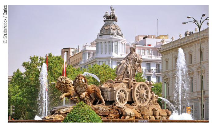
A capital city on a human scale, Madrid offers a unique lifestyle

To help achieve this, the city is investing in vast infrastructure developments, such as the mixeduse Madrid Nuevo Norte. "It's the largest urban development in a European capital and will create a fully sustainable city of the future. As well as appealing to businesses, it will generate affordable housing, enabling us to retain our highly qualified young people and attract new talent," he reveals. According to Ángel Asensio Laguna, president of the Chamber of Commerce, Industry and Services of Madrid, there are many other advantages for investors: "Its location is strategic, as a key bridge to the Americas, Europe and Africa. It also offers institutional and legal security, low taxes, supportive authorities, large universities and a favorable ecosystem for growth."