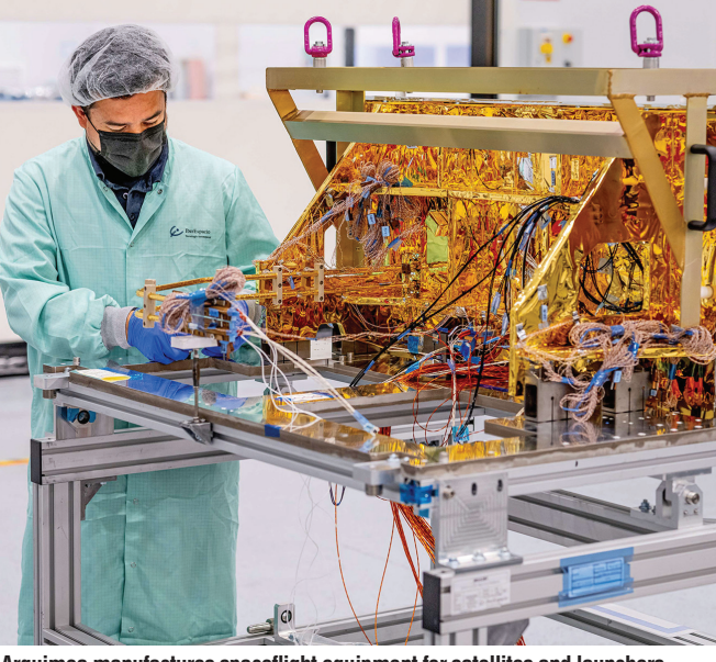
Arquimea manufactures spaceflight equipment for satellites and launchers

DF: When you analyze the business plans of the constellations that arrived first in this sector, you