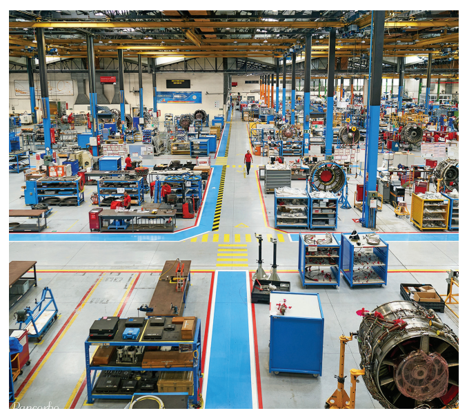
Iberia's 1.7 million square meters maintenance facility

Contributes 1.7% to Spanish GDP and over 50,000 jobs