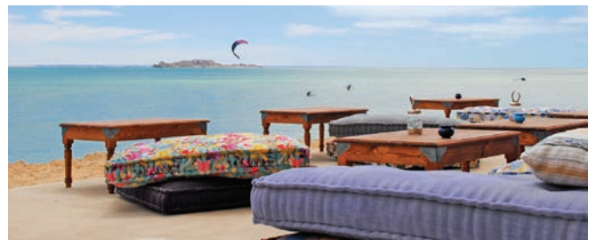
PK25 Hotel, Dakhla

Investors are flocking to Dakhla to tap its massive potential