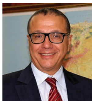
Mohamed Boussaid Minister of Economy and Finance

"Africa is the continent of the future, but it is also a fragmented continent with many small economies; large international groups cannot be present in 54 different