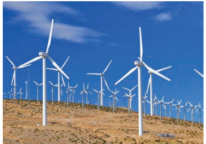
Tarfaya wind farm, on the Atlantic coast

SOMAGEC has also been luckier than others to some degree. Oil prices were high during the years that we entered the African market. It would now be much harder for a Moroccan company to survive the business adventure we threw ourselves into. The truth is that it's a huge challenge today to be a Moroccan professional embracing the international market. What happens if the client doesn't pay? You can't do a thing. Now with oil prices very low, I can't see how a