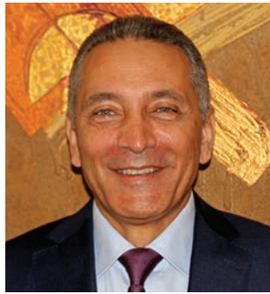
Moulay Hafid Elalamy Minister of Industry, Investment, Trade and Digital Economy

Guiding this eye-catching industrial growth is Morocco's Industrial Acceleration Plan, which