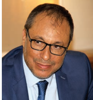
Abdelkader Amara Minister of Equipment, Transport, Logistics and Water

“From Tangier to Casablanca, from Marrakech to Agadir, we have a motorway network con-