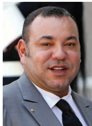
King Mohammed VI of Morocco

While culturally speaking Morocco's identity may be said to align with Arab states, its economic interests increasingly lie in Africa and the King is backing moves to explore opportunities in sectors from mining and construction to medicine, insurance and banking across the continent. Morocco is no newcomer to the world of heavy investing in Africa — it