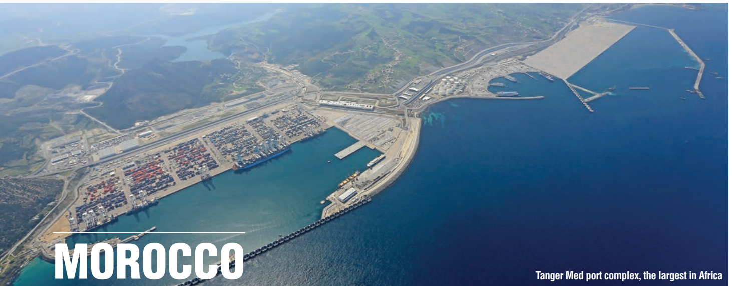
Tanger Med port complex, the largest in Africa