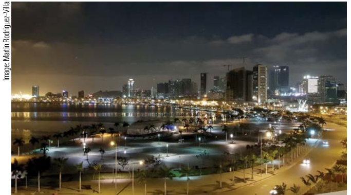
Luanda, Angola's capital, has become a thriving and modern city

President Lourenço announced that the deficit, which reached 5.6% of the GDP last year, was forecast at “less than 1% of the GDP for 2019, with an estimated increase of 9.8% in tax revenue.” He also noted that inflation