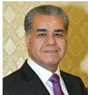
Falah Mustafa Bakir Minister of Foreign Relations