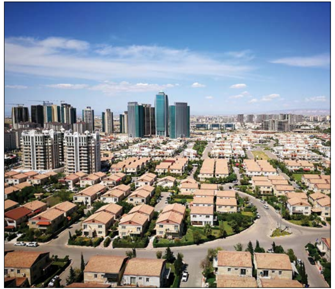
Erbil: KRG's capital and a hub for foreign investors

Falah Mustafa Bakir Minister of Foreign Relations