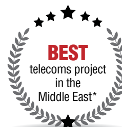
* Global Carrier Awards