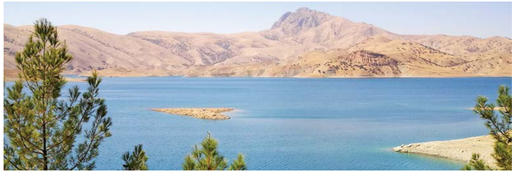
A new $1.6 billion tourism infrastructure project is planned for Lake Dukan in Sulaimani province

In addition to being safe from terrorism, international visitors are highly unlikely to experience violent crime from a population that is extremely friendly to foreigners, especially those from countries like the US that supported them in 2003. As a secular and liberal region, it is also unusual for women to face harassment. Additionally, theft is uncommon — it is a very honest and trusting society. The 24-hour security at the majority of commercial and residential properties provides further reassurance that KRG is a place where foreign travelers are safe.