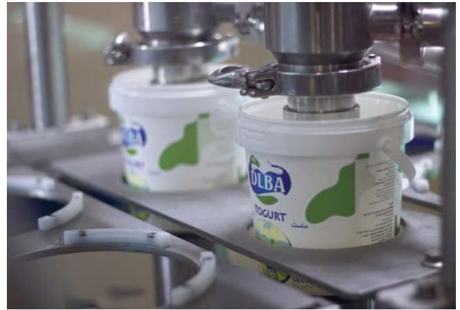
Healthy Dairy — Healthy Life