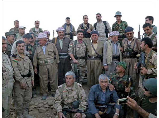
Peshmerga, the name of KRG's army, means 'those who face death'

Nearly 2,000 KRG soldiers died over the next three years but not in vain — their experience and courage proved vital in the inter-