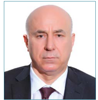
Nawzad Hadi Mawlood Governor, Erbil Governorate

cially, agriculture," states Nawzad Hadi Mawlood, governor of Erbil Governorate.